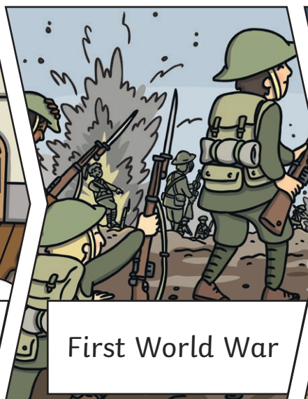
First World War